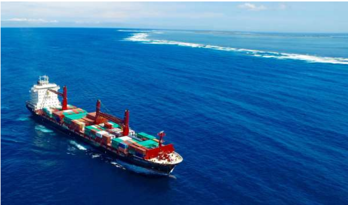
MV Coral Chief, is one of the CNCo's vessels servicing the Pacific islands.