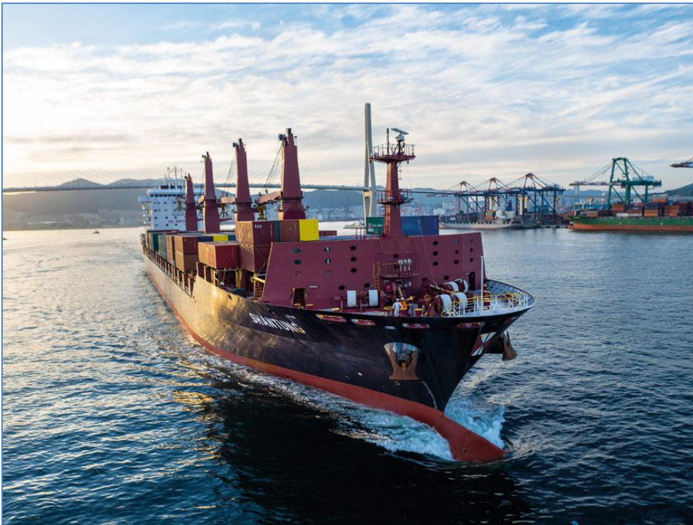
Swire Shipping vessel MV Shantung