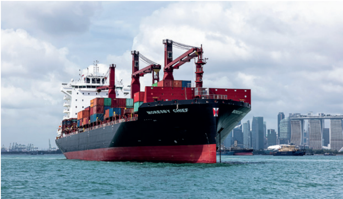
Moresby Chief – Swire Shipping's container vessel.