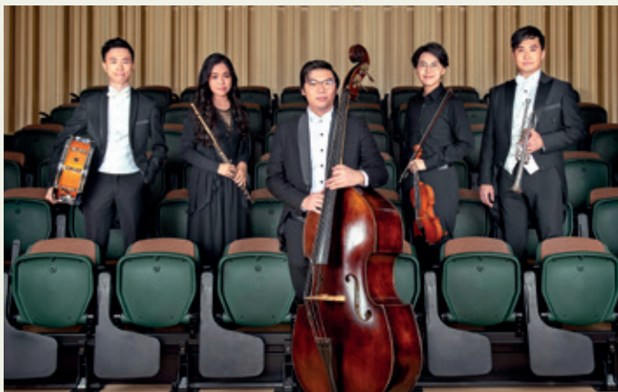
The Orchestra Academy Hong Kong is a good example of how NGOs benefit from skilled volunteering. The HK Phil/School of Music of The Hong Kong Academy for Performing Arts joint programme provides aspiring musicians with professional performance experience and mentoring; it is run by just one full-time project manager – but is made possible through the support of Time Auction volunteers.

Since the start of the project in June 2020, TA has connected over 5,000 volunteers with NGOs in Hong Kong, accumulating more than 30,000 skilled volunteering hours. It has also provided around 100 experiential and mentoring rewards – especially impressive given the ongoing pandemic!