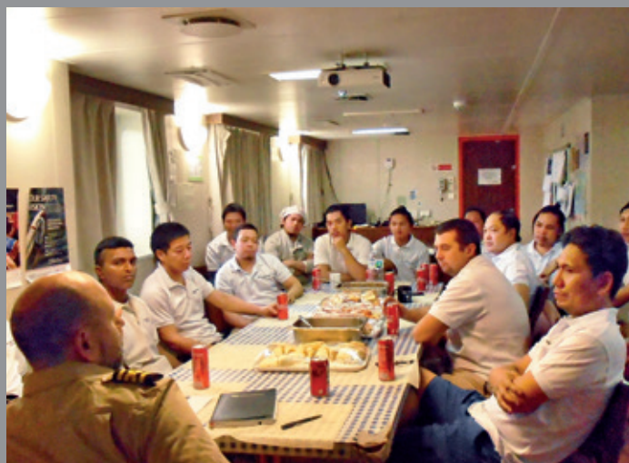
Ship's personnel on Eriskay share snacks and discuss the importance of looking after their mental health.