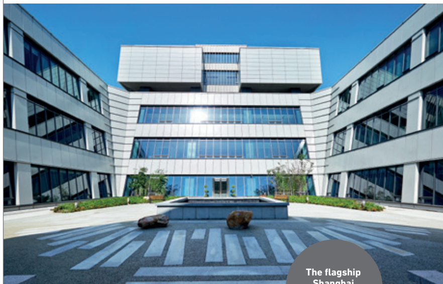
The flagship Shanghai DeltaHealth Hospital.