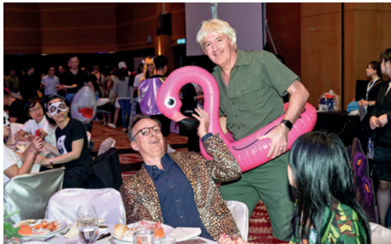
At the Swire Properties' annual staff dinner 2017.