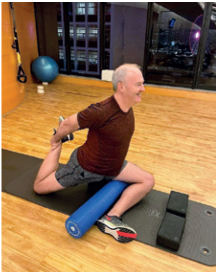
Enjoying yoga in his spare time.

I haven't got into the meditation side yet but the flexibility it brings as you get older is very important.