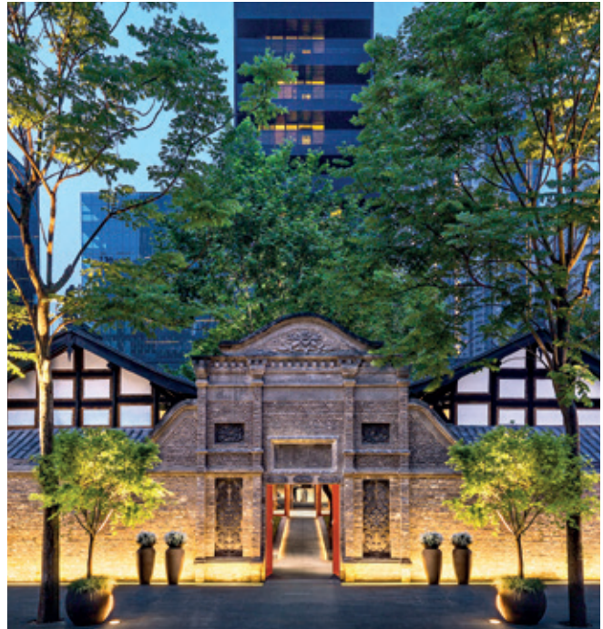
The Temple House, Chengdu