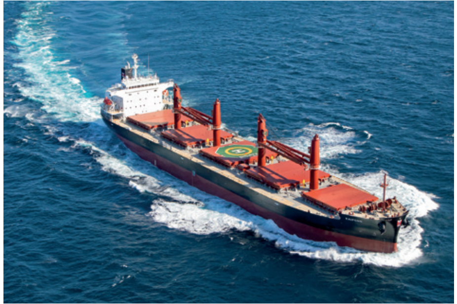
Kaifong – Swire Bulk’s bulk carrier.