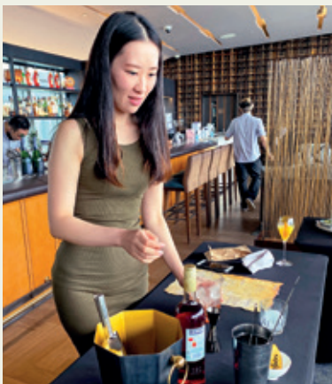
A cocktail mixology class at EAST Hong Kong is one of the reward experiences that can be redeemed by volunteering with Swire Trust Go-Givers Programme.