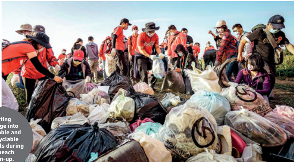
Sorting garbage into recyclable and unrecyclable materials during the beach clean-up.

employees took part in the day's event, collecting a total of 664.1kg of garbage, including 646.2kg of unrecyclable material, 2.7kg of recyclable glass, and 15.2kg of PET packaging, and clocking up 372 volunteer hours.