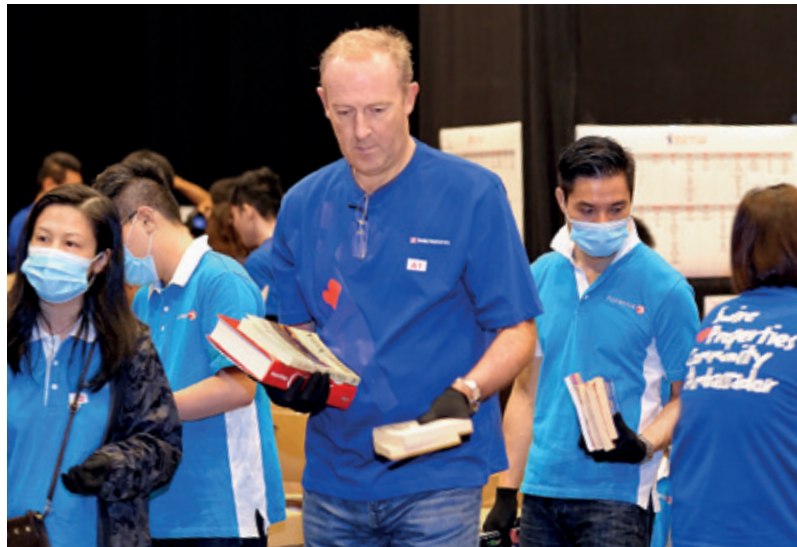
At the Community Ambassadors' Books for Love charity sale in 2016.

I don't really have a favourite but the variety was what interested me the most. My first job was in Papua New Guinea and my second was in Japan – such very different places! If you ask me where I call home – it's here in Hong Kong. It's efficient, pragmatic, dynamic and culturally layered. It's such a world class city.