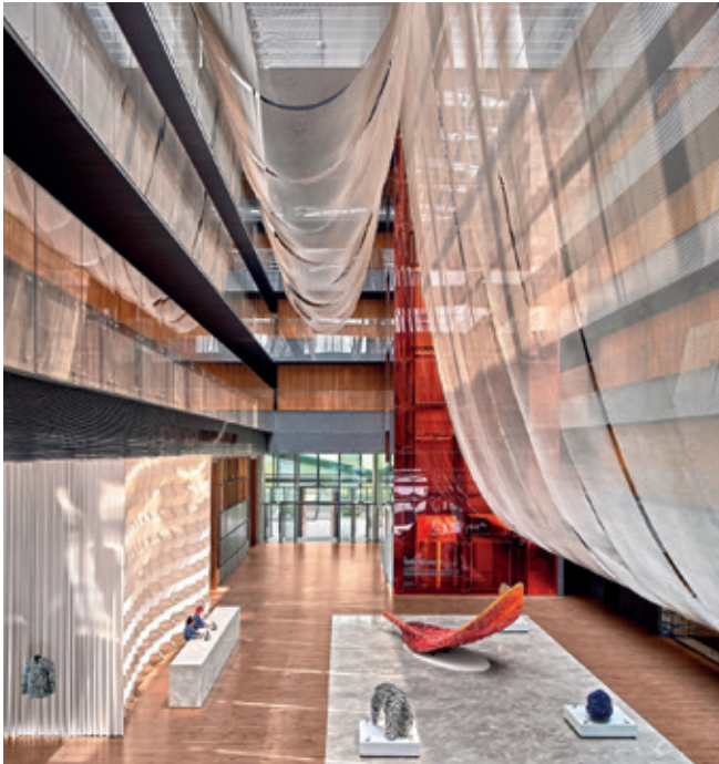
The Opposite House, Beijing

Asia City Hotels"; it also topped the "Top 5 Hotels in China" category, with The Temple House in Chengdu coming second and The Upper House in Hong Kong in fourth place.