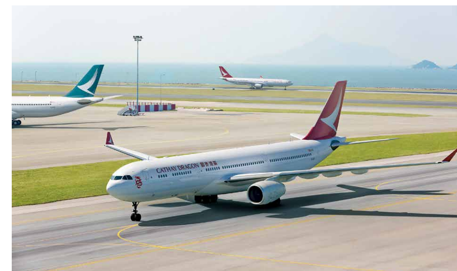
The rebranding of Dragonair as Cathay Dragon will see a new livery that features a Cathay-style brushwing logo, symbolising the close partnership and shared brand values of the two airlines.