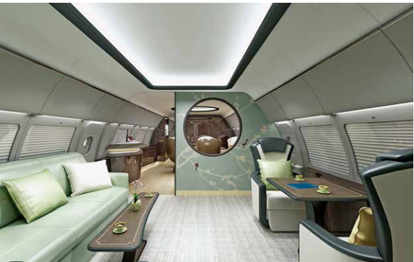
HAECO Private Jet Solutions' new cabin design concept, "Zen"

In May, HAECO Private Jet Solutions launched a new concept in cabin design for narrow-body aircraft at the European Business Aviation Convention & Exhibition in Geneva. "Zen" takes its inspiration from the Zen school of Buddhism, whose tenets are harmony, relaxation and balanced living.