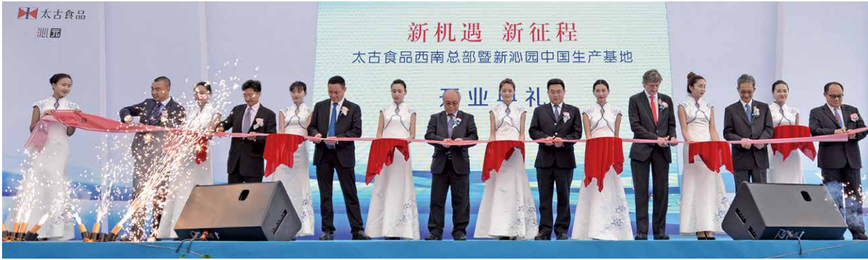
Chongqing government officials joined Swire Foods senior management at the launch ceremony for the new bakery plant.

On the same day, Swire Foods opened new regional headquarters in Chongqing, marking a new chapter in Swire's food business in Mainland China. The move will enable Swire Foods to tap into the logistical advantages of the city as a regional hub, to satisfy the increasingly discerning tastes of Chinese consumers with a series of premium quality food products.