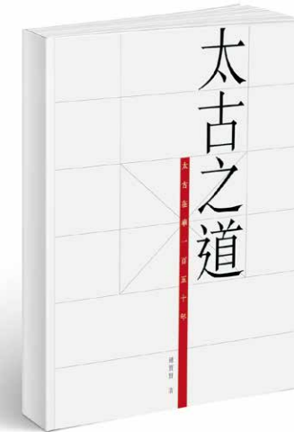
"The Taikoo Way – Swire in China for 150 years" is available in Shanghai Joint Publishing bookstores and major online stores nationwide.