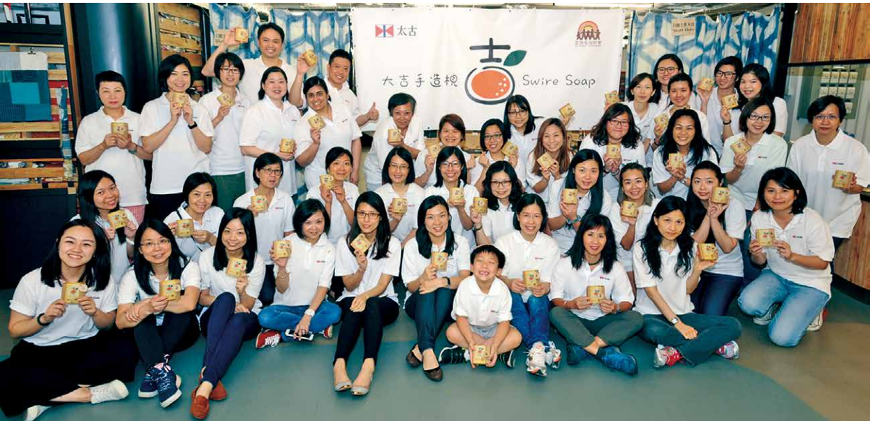
Over 100 volunteers took part in the soap-making and packaging sessions.

In May, Swire volunteers took part in a soap-making workshop and packaging session at St. James' Settlement's (SJS) upcycling centre. Their goal was to make and package 800 bars of soap using "recycled" Chinese New Year kumquats collected at Swire Properties' managed buildings around Hong Kong.