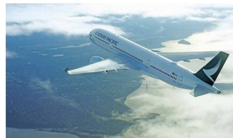
The lightweight design and composite construction of the A350 allows Cathay Pacific to fly to more long-haul destinations.

"It's simply beautiful. Every time we invest in a new product, we ask ourselves three questions: what's new, is it better than before and is it better than what our peers offer?"