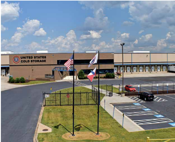
The new USCS facility in McDonough, Georgia

United States Cold Storage ("USCS") has opened a new facility in McDonough, Georgia, offering 8.6 million cubic feet of warehouse and distribution space. Located within the Atlanta metropolitan area, the new facility has over 26,000 pallet positions, 33 truck doors and four rail doors serviced by Norfolk Southern railroad, as well as a secure 30-spot drop lot. The McDonough site offers value-added services including repack, specialised case picking and order assembly. With the addition of McDonough, USCS offers a total of 261 million cubic feet of warehouse space at 38 facilities across 13 states.