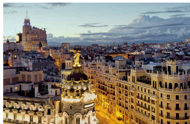
The new service between Hong Kong and Madrid provides easier access for passengers travelling from Southern Europe to key destinations in the Asia Pacific region.

Another destination earmarked is Gatwick Airport in the UK. "At Gatwick, we will be resuming our operations, which ceased in the 1990s. It was our first airport in the UK, but today it's a very convenient hub for carriers who fly to European destinations. We can take advantage of this by offering direct flights, as an alternative to Heathrow Airport."