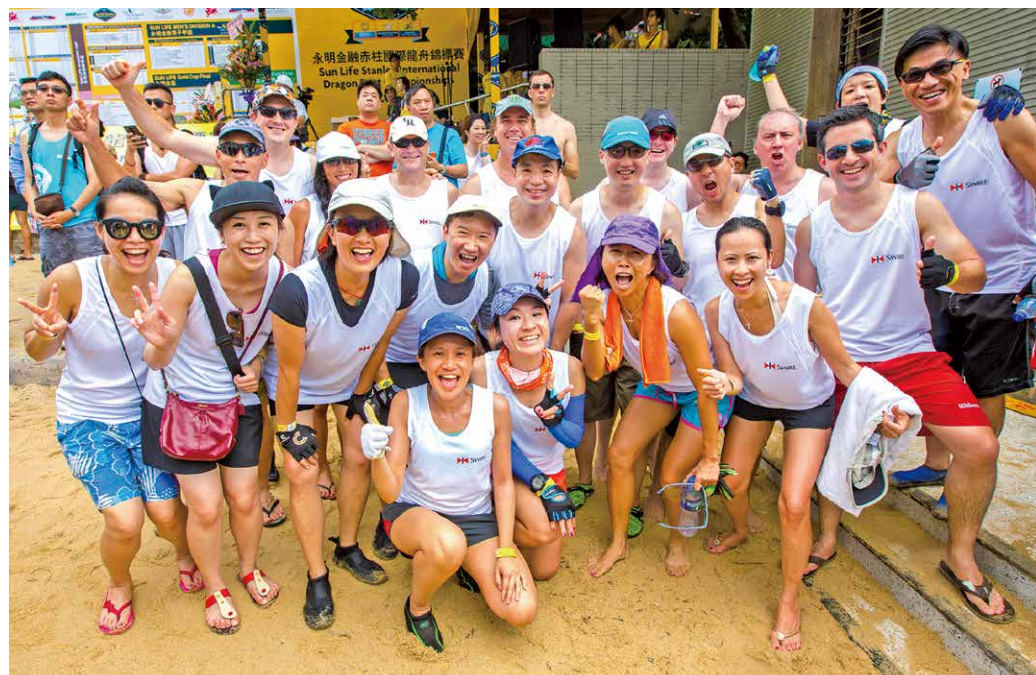
The enthusiastic Swire Dragons and Swire Dinosaurs team members.

Tuen Ng Festival this year meant something more than rice dumplings for two John Swire & Sons (HK) Limited dragon boat teams, and the loyal support teams keeping them fed and watered and cheering them on to greater efforts.