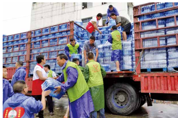
Swire Coca-Cola Beverages Hefei delivers 48,000 bottles of safe drinking water to a village near Luan City.

In June and July, heavy rain in Anhui Province in Mainland China caused severe flooding and affected drinking water supplies in the counties of Xiuning, Susong, Wuwei, Chaohu, Tongcheng, Shucheng, Zongyang and Feidong. To provide urgent relief to around 50,000 residents in the worst-affected areas, Swire Coca-Cola Beverages Hefei launched a "Clean Water 24" campaign, delivering more than 825,000 bottles of Ice Dew Water to local communities in need.