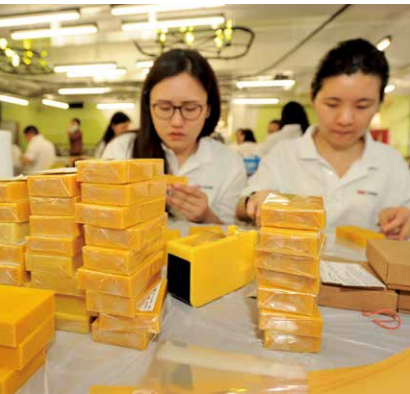
Great team spirit ensured all the soaps were nicely packed within a morning session.

people in need with temporary free food assistance. A special charity sale for Swire staff was also held, raising a further HK$8,360 to support this meaningful initiative. Since 2011, Swire group volunteers have helped to produce "Swire Jam" from Chinese New Year kumquats in collaboration with SJS. This is the first year they have turned their attention to making Swire Soap and the initiative has been well received by the community.