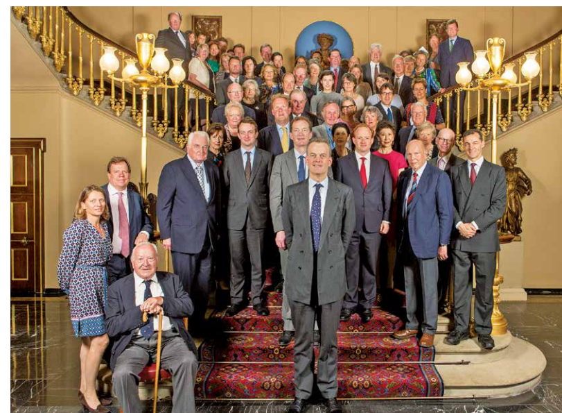
John Swire & Sons Limited directors, shareholders and advisors to the board attended the company's 2016 Annual General Meeting, which was also held on 23rd June.