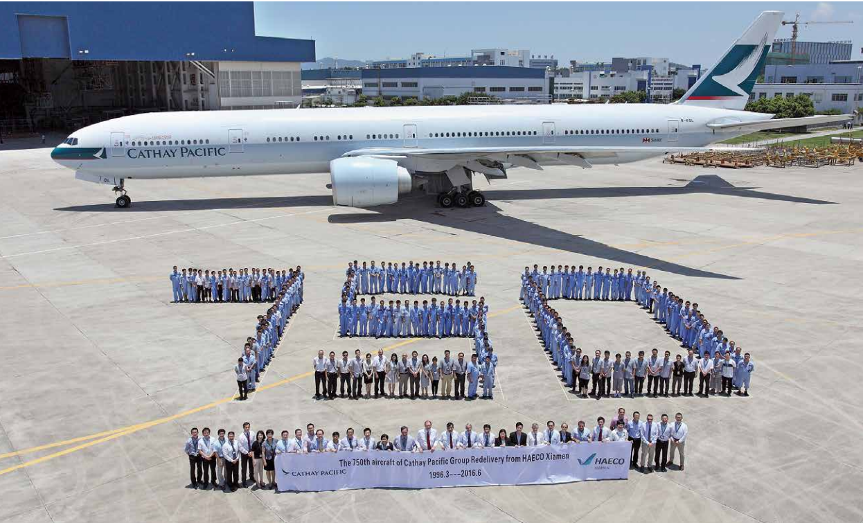
A ceremony was held at HAECO Xiamen on 23rd June to mark the redelivery of Cathay Pacific Group's 750th aircraft input.

747s, 250 Boeing 767s, 200 Boeing 777s, 170 Airbus A330s, and 650 narrow-body aircraft, and the MRO has also completed 61 passenger-to-freighter conversions on Boeing aircraft and over 300 cabin modification projects for airlines and private jets from around the world.