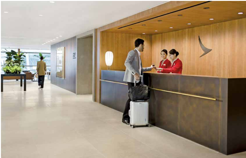
The new lounges at Vancouver International Airport (top) and Hong Kong International Airport align with Cathay Pacific's brand ethos – an emphasis on contemporary Asian elements alongside a focus on warmth and simplicity.

Cathay Pacific recently opened a new First and Business Class passenger lounge in Vancouver and unveiled its newly refurbished and expanded Business Class lounge, The Pier, at Hong Kong International Airport. A relaxed aesthetic is created by using warm, natural materials such as limestone and cherry wood, alongside softened acoustics and lighting and an abundance of plant-life. Both lounges offer comprehensive facilities for business travellers, as well as a range of dining options, including Cathay Pacific's signature Noodle Bar, featuring Asian favourites.