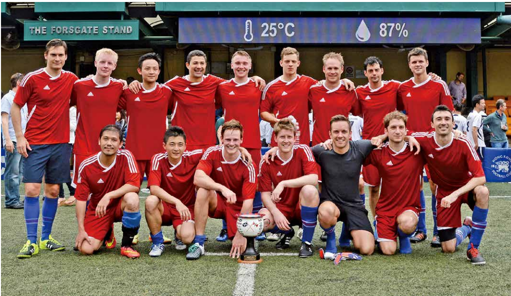
The Swire team