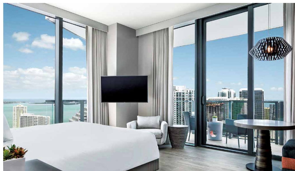
EAST, Miami offers a distinctive experience for guests seeking innovation, style and personalised service.

Swire Hotels has opened EAST, Miami, the anchor hotel in Swire Properties' mixed-use development, Brickell City Centre, in Miami, Florida. Offering 352 guest rooms, with eight suites and 89 residence suites, the hotel brings to its guests distinctive views of the Miami skyline and Biscayne Bay and features destination dining, state-of-the-art fitness facilities and quality amenities such as walk-in rain showers. EAST, Miami is the third hotel launched by Swire Hotels' Hong Kong-based EAST brand, after the successful openings of EAST, Hong Kong in 2010 and EAST, Beijing in 2013.