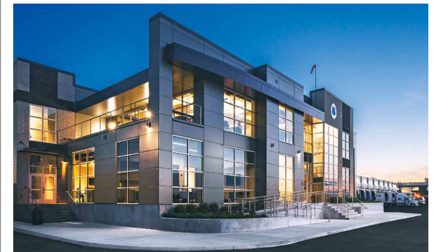
USCS' Covington facility in Tennessee

facility has implemented a range of energy-efficient technologies that have helped reduce the warehouse's energy consumption by 32%. Other initiatives include the use of vegetated swales to reduce storm water discharge, native species landscaping to eliminate irrigation requirements and the installation of bicycle racks to promote alternative transportation practices and reduce vehicle emissions.