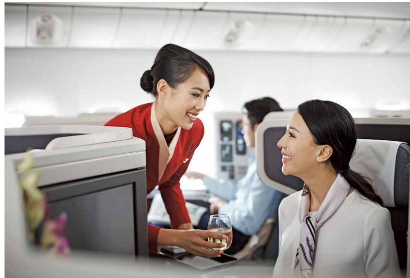
With new branding, lounges and inflight products, and its signature Service Straight from the Heart, Cathay Pacific's "Life Well Travelled" brand philosophy focuses on enhancing customers' overall travel experience.