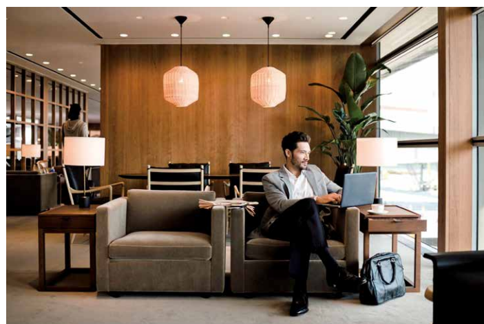
Reopened in June 2016, The Pier Business Lounge is the largest of Cathay Pacific's eight lounges at Hong Kong International Airport, measuring 3,306 square metres, and is able to accommodate 550 travellers.