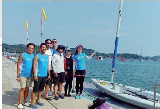
HAECO Hong Kong team members at the 24 Hour Charity Dinghy Race 2018.

During the review period, HAECO Hong Kong supported the 24 Hour Charity Dinghy Race 2018. Our employees formed a team to join this endurance challenge to raise funds for children in need and the less abled in the local community.