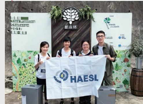
Four dedicated conservationists from HAESL planted trees in Hong Kong's countryside.

HAESL continued to support a variety of environmental initiatives during the year. In particular, HAESL organised two tree planting events to raise awareness of climate change. These events combined tree-planting, hiking and a test of participants' endurance, while helping to spread the message of Save Trees, Conserve Nature.