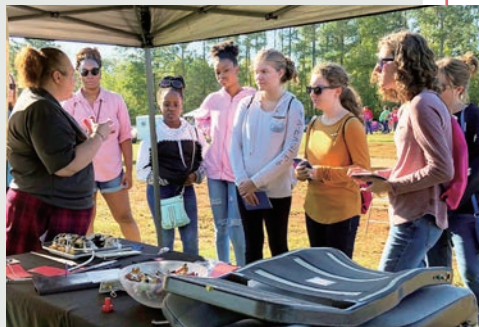
Girls in Aviation Day

In 2018 HAECO Americas sponsored Girls in Aviation Day, which encourages young women to explore careers in aviation, for the second year running. In this day of fun and interactive activities, girls can spend time with influential aviation role models. This initiative forms part of our diversity and inclusion programme at HAECO Americas.