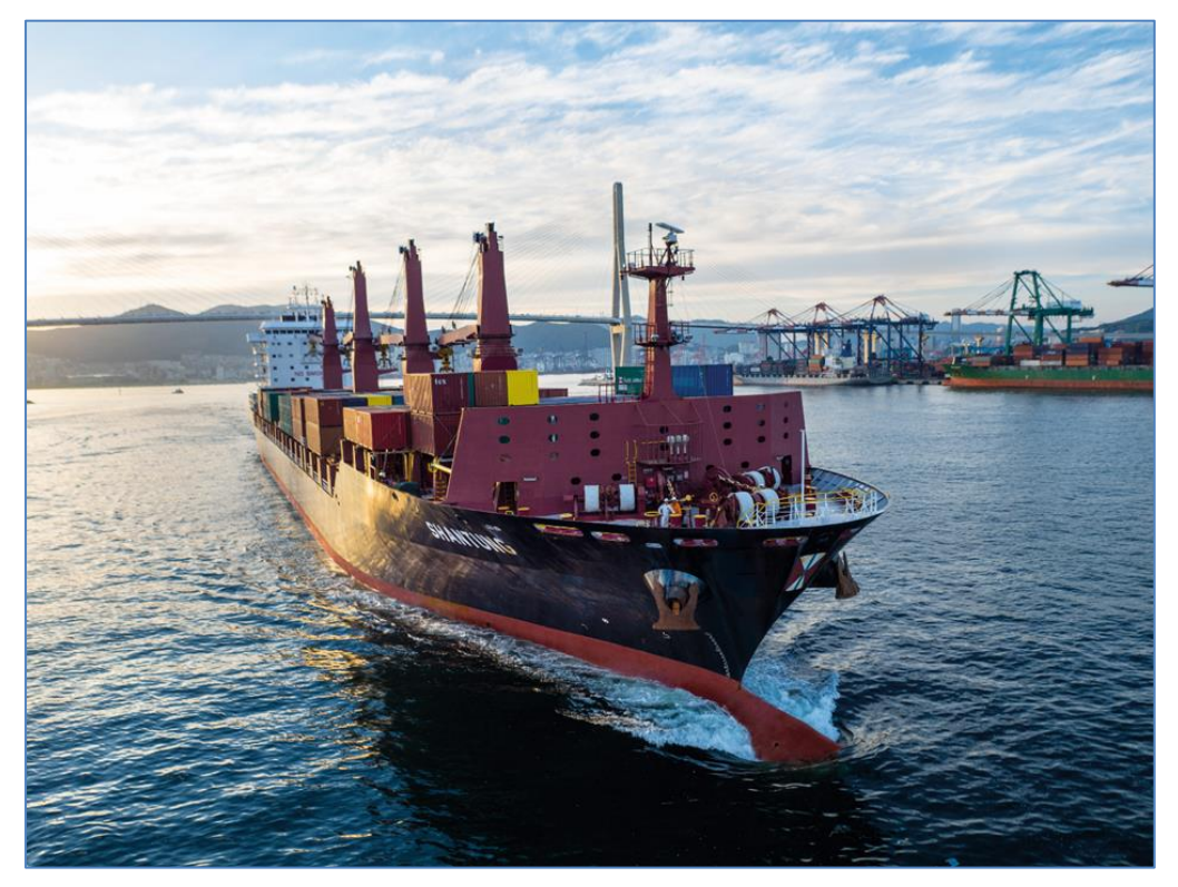
Swire Shipping vessel MV Shantung