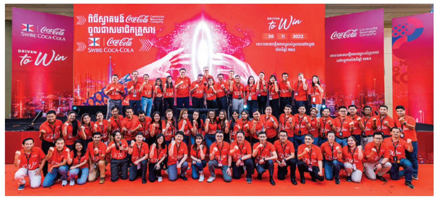
In November 2022, Swire Coca-Cola teams gathered to celebrate this milestone for the company.

sold by roadside vendors over ice. This dilutes and chills these types of beverage, making them suited to the hot climate.